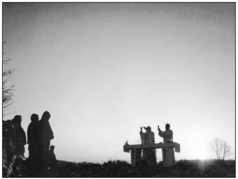
Millennium Dawn Mass at Grange Stone Circle.