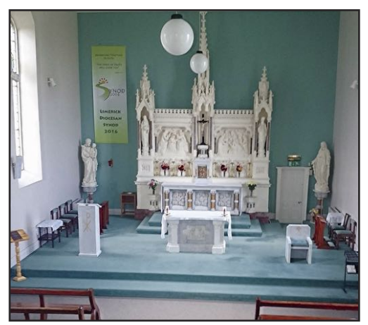
Original altar in Grange Church.

grounds that had already been partly planted.