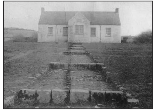
Original Grange School building of 1867.

A national school education was provided to the many children of Grange Parish over more than a century, providing a foundation for their lives ahead of them, and for many, to go on to further their