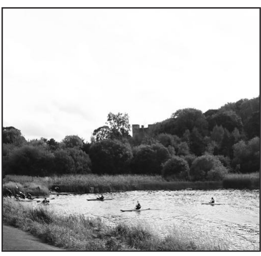
Upper profile of Bourchier's Castle, seen through woodland.

The visual character of the area is defined by the enclosing circle of limestone hills, forming an intimate environment that is complemented by the serenity of the lake. The hill summits offer impressive panoramic views of the agricultural plains in all directions. Low-level views across the lake are for the most part unspoilt and distinguished by the backdrop of the hills and their reflections in the water. To