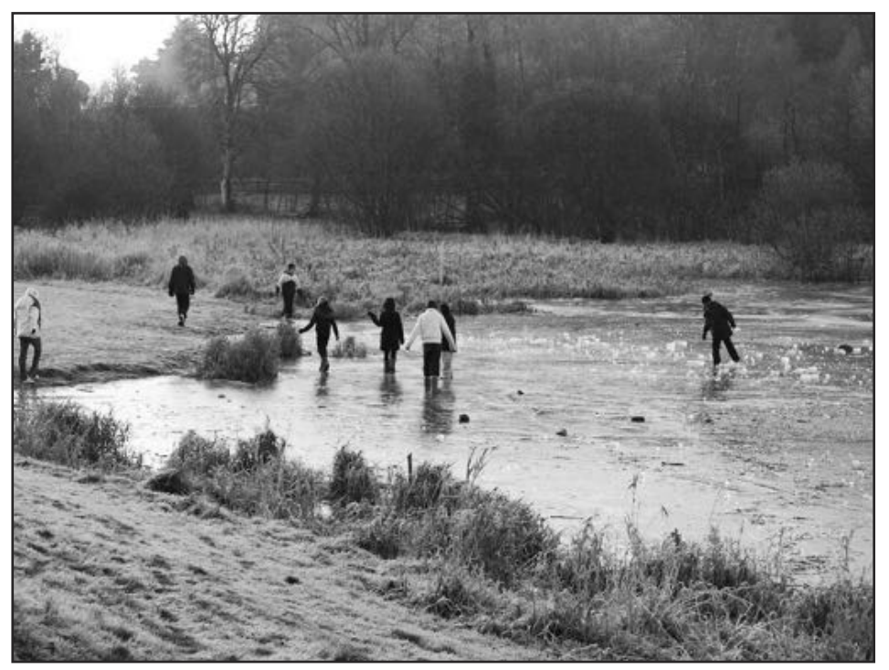
Lough Gur frozen over.