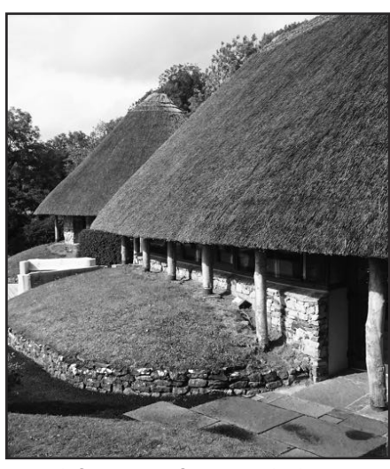
Lough Gur Heritage Centre neolithic house style.

Swallow - Sum Swift - Sum House Sparrow – Res Reed Bunting - Res House Martin - Sum Sand Martin - Sum Skylark - Res Meadow Pipit – Res Dunnock - Res Pied Wagtail - Res Grey Wagtail - Res Wren - Res Whitethroat - Sum Willow Warbler - Sum Chiffchaff - Sum Blackcap - Win/Sum Stone Chat - Res Spotted Flycatcher – Sum Robin - Res Fieldfare - Win Blackbird - Res Redwing - Win Mistle Thrush – Res Song Thrush – Res Starling – Res