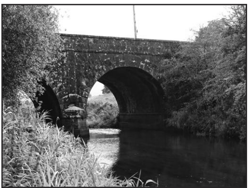
View of bridge at Lower Grange.

(3) Grange Castle – Source: John O'Donovan, Ordnance Survey letters 1840.